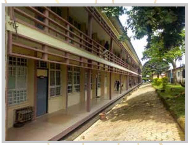
Faculty Annex Building

Decades after its construction, the Faculty of Arts Annex, which hosts the Departments of Arabic and Islamic Studies, Philosophy and Theater Arts, has been renovated. Tiling and painting of the building have been carried out. The complex now presents that ambience that befits a scholarly environment that we all deserve and desire.