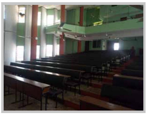
Faculty LLT Now

Again, after decades of total neglect, we succeeded in renovating the Faculty Large Lecture Theatre. We provided new furniture items for the hall, repaired the ceiling fans and provided new ones where necessary. We also painted the SLT and worked tirelessly to repair the leaking air-conditioning system in the room.