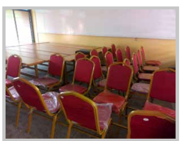
New chairs for the Faculty Classrooms