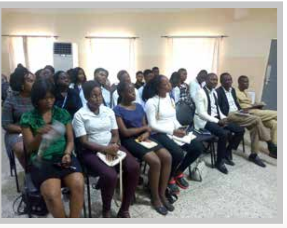
A cross section of attendees at the lecture