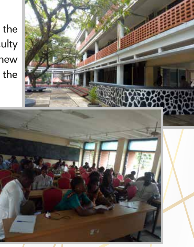
Room 37 after Renovation

During the past one year, we strove to improve the general ambience in the Faculty by painting the Faculty quadrangle and the corridors. We also provided new tiles to the corridor that is adjacent to the office of the Dean and purchased new flower pots.