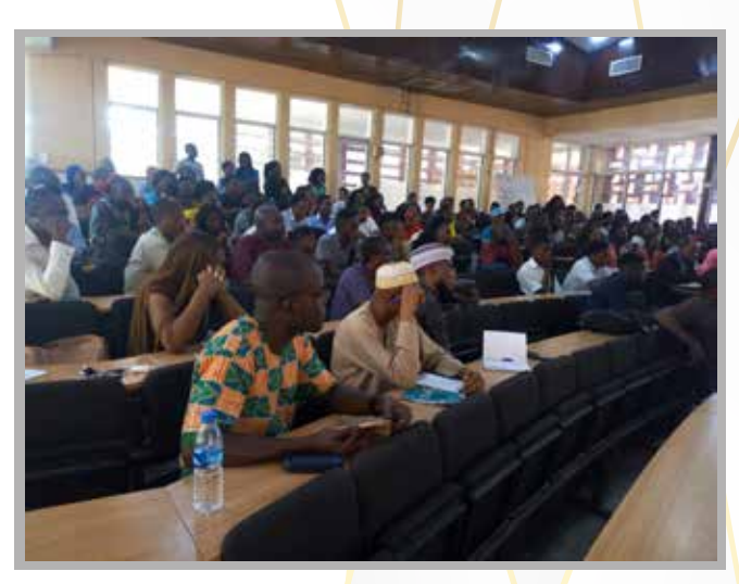
A cross section of attendees at the Faculty Seminar