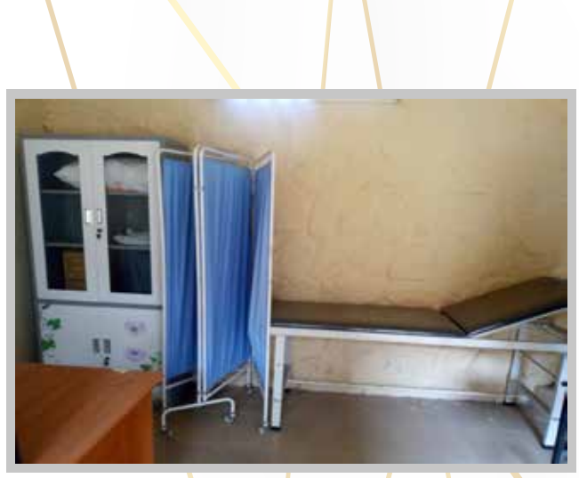
Faculty Wellness Centre

Early this year, we designated a place as the Faculty's Wellness Centre (FWC). We also sought and got approval for the provision of necessary tools and equipment for the Centre from the Faculty Finance Committee. These have since been supplied by the vendor and certified for use by experts from the University Health Centre.