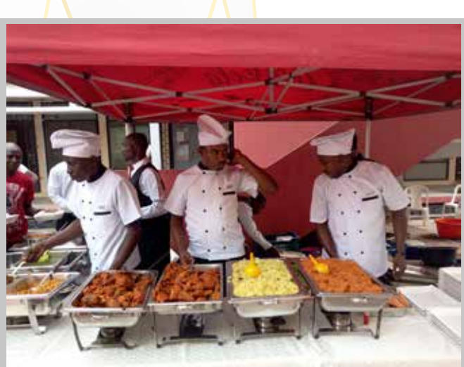
Waiters during the get-together